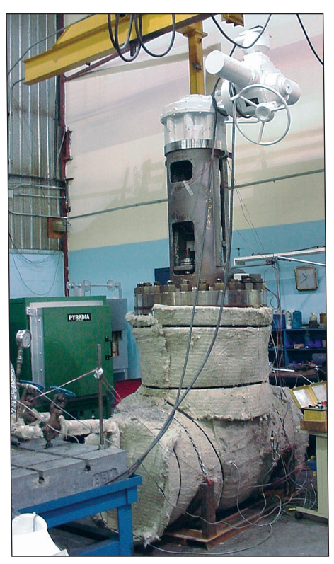
Baseline diagnostic testing at elevated temperatures.

designs that meet the latest industry standards. Velan R&D remains committed to developing and qualifying valves for this ever-evolving industry.