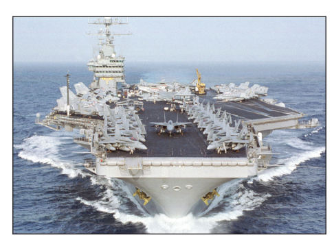
The USS Dwight D. Eisenhower, one of several nuclear-powered Nimitz-class aircraft carriers standardized on Velan valves and steam traps.

While the testing that is performed on military applications is very similar to that for nuclear service, military valves must also be subjected to mechanical and thermal shock tests.