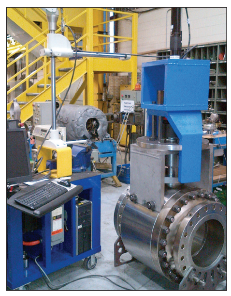
Valve qualification testing.

Velan's severe service valves are custom designed to handle applications that can't be adequately handled using established materials and commercial valve designs. As a result, severe service valves require significant R&D to address the specific performance requirements for processes in which a valve undergoes harsh conditions such as high speed actuation, high temperature, acid leach, slurry, and more.