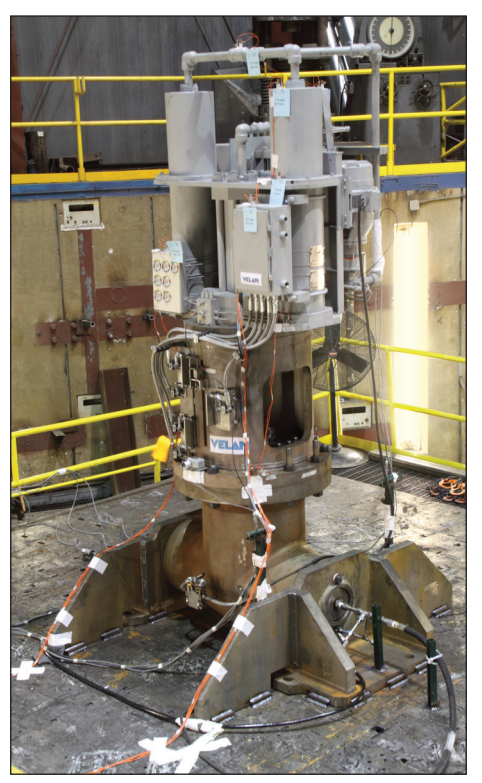
Seismic qualification testing<sup>(1)</sup>

This extended experience and engineering know-how allows us to provide optimal