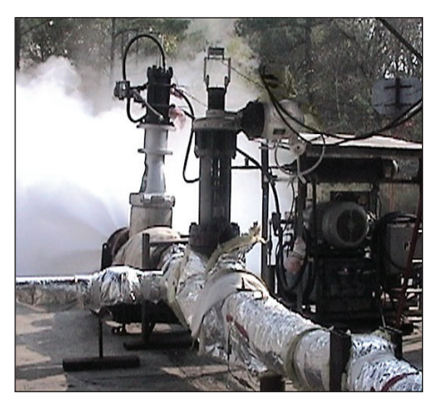
Line break testing (blowdown) (1)

Other important tests include blowdown testing which validates the valves safety performance capacity to a line break simulation. Also, baseline diagnostics testing allows us to compare valve signature to established parameters, and plays a significant role in future preventive maintenance decision making process.