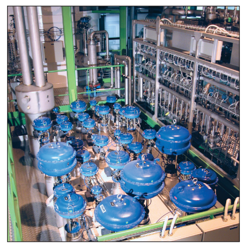
Some of the 2,500 Velan cryogenic valves for liquid helium installed in the Large Hadron Collider (LHC) at CERN.

Velan is an industry leader in the cryogenic field, and has supplied cryogenic valves to a wide range of applications ranging from standard commercial LNG (liquefied natural gas) processes to specialized liquid helium valves used to cool particle accelerator magnets (at CERN, for example). As such, we can provide complete cryogenic testing and qualification services.