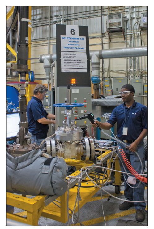
API 624 fugitive emissions qualification testing.

Velan strives to offer qualification solutions to meet the most stringent industry standards such as API 622, API 624, API 641, ISO-15848-1/2, and Ta Luft.